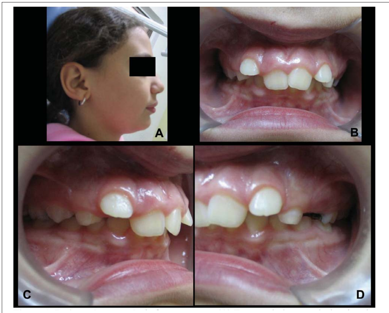
Figure 1. Patient photographs before treatment. (A) Extra-oral photograph showing the profile; (B) Occlusion frontal view; (C) Occlusion right side; and, (D) Occlusion left side.