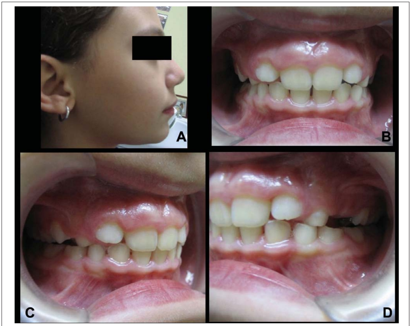
Figure 3. Patient photographs after 12 months of treatment with the T4K. (A) Extra-oral photograph showing the profile; (B) Occlusion frontal view; (C) Occlusion right side; and, (D) Occlusion left side

The differences between before and after treatment measurements were higher than those expected to be produced by natural growth in Brazilian females. The natural growth for the maxilla and the mandible for a 10 to 11 year old Brazilian female is expected to produce an increase of 0.2^\circ for both SNA and SNB angles, and a reduction of 0.1^\circ in the ANB angle. In the case here presented, point A moved forward 0.8^\circ and point B moved 4.5^\circ , which reduced the ANB angle by 3.8^\circ . Additionally, the distances Co-Gn and Co-A increased 4.3 and 4.1 mm respectively, while the natural growth for those distances is expected to produce an increase of 2.8 and 1.7 mm respectively. Vertically, the ANS-Me distance increased by 3.1 mm; this is higher than that expected from natural growth (1.1 mm). The values for the cephalometric measurements performed before and after treatment, the correspondent matched values of normative data for 10 and 11 year olds and the differences between before and after treatment are shown in Table 1.