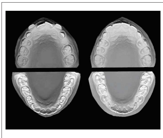
Figure 2. Study models before (A) and after (B) treatment. Sufficient space for tooth alignment from the mixed dentition analysis before treatment and, good dental alignment achieved after 12 months of treatment with the T4K.

2; deep bite with adequate transverse development.